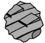
DETAIL A SCALE 1 / 20