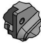
DETAIL B SCALE 1 / 20